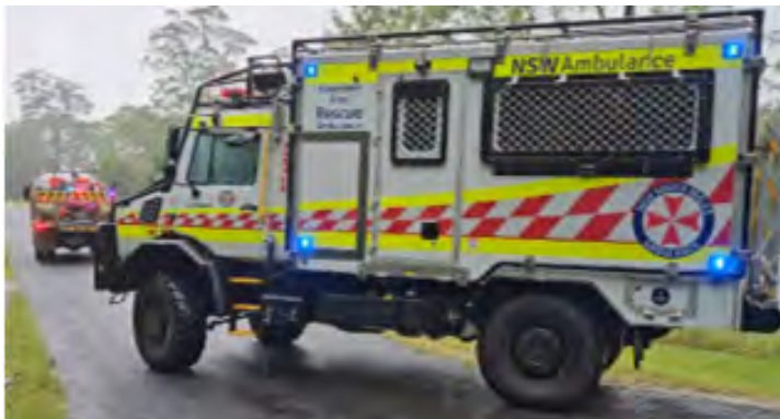
A new high-clearance Unimog ambulance retrieved a patient from Pumpenbil on Sunday 9 March.

The general consensus is that we got off lightly. Everyone will take their own lessons from Alfred. Solar power, batteries, generators and Starlink satellite internet seem to be the current disaster must-haves. The effect on insurance premiums remains to be seen.